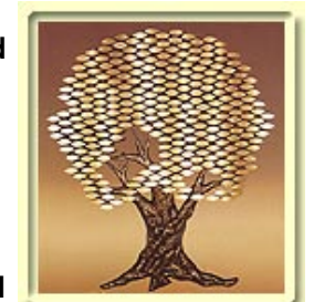
Sample of the giving tree to be placed in our school lobby. Slight variation may occur.

Founders Society members will have their names engraved on bronze stones placed at the base of the tree alongside the names of the original benefactors who were integral in the building of the school 50 years ago.